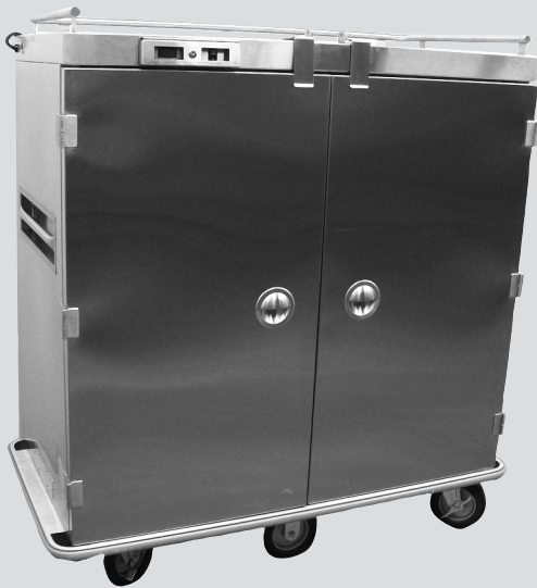
Model HQ-HA-AF shown